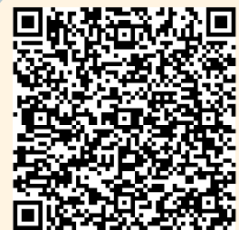
Last amendment on August 5, 2021