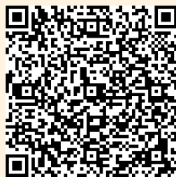
Amendments to SEBI PIT Regulations